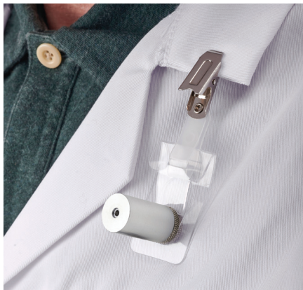
Positioning for personal monitoring

When used for fixed location sampling, the sampler should be placed at an appropriate site in the atmosphere of interest. Samplers can be placed on a flat surface or can be hung in position using the supporting plate and clip.